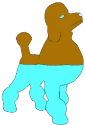
Celestial Poodle Peter & Robyn Crompton Why do you think this poodle is called "Celestial Poodle"?